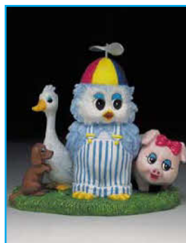
Good Friends will lift your spirit S7017