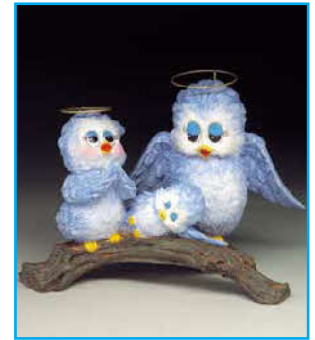
God Parents are guardian angels on earth S7053