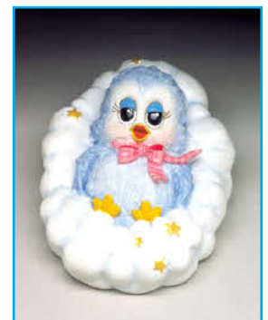
A Baby Girl a perfect miracle S7008G