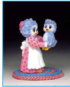
Forgiveness - the lifting of the spirit S7043