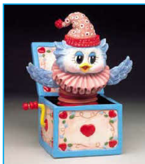
It's no surprise miracles happen S7027