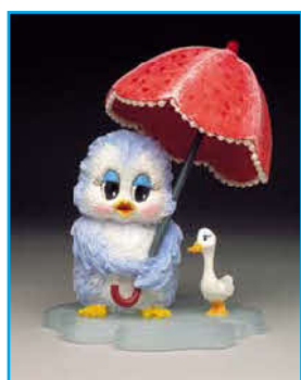
Come out from under the weather S7021