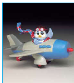
Faith promises a safe landing S7028