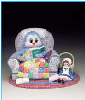
Strengthened by the warmth of the family S7047