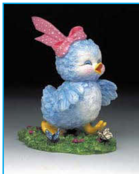
Remember there's a blue sky behind the darkest cloud S7010

Unit 17, Churchill Business Park, Churchill Road, Doncaster DN1 2TF Tel: 01302 367868 Fax 01302 361006 E-mail sales@harvestfields.biz www.harvestfieldsdistribution.co.uk