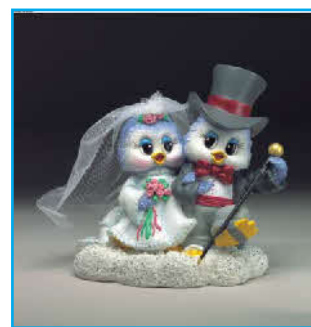
Together we are going places S7077