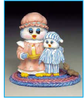
My trust in your light shows me the way S7044