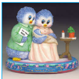
The answer to our prayers S7090