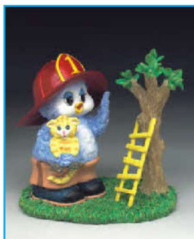
A Tribute: For you answer the call S7078