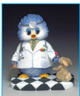
A healing touch S7074