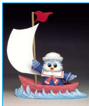
Sail into a glorious future S7023