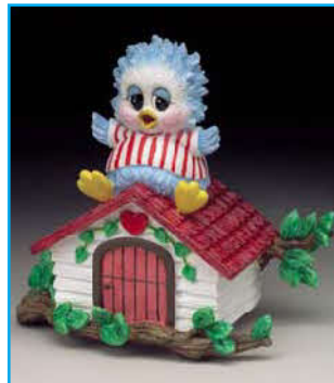
Bless this house with joy and love S7007