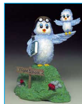
It's your time to soar S7037