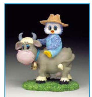
You are like no udder S7068