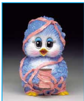
Friends are tied together with ribbons of love S7070