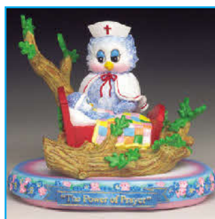
Healing with faith, love and prayer S7093