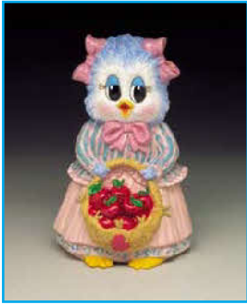
Thank you for the seeds of knowledge S7041

Unit 17, Churchill Business Park, Churchill Road, Doncaster DN1 2TF Tel: 01302 367868 Fax 01302 361006 E-mail sales@harvestfields.biz www.harvestfieldsdistribution.co.uk