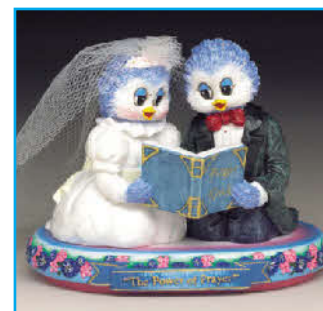
Together forever in love and prayer S7091