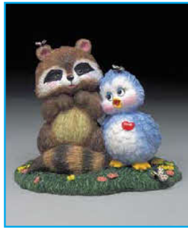
We celebrate our differences S7042