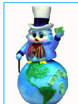
You're worth the world to me S7018