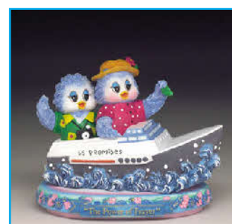
Let faith be your guide S7095