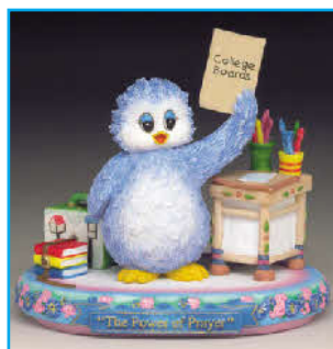
College boards - your faith will bring success S7092