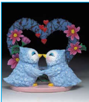
May love always be in full bloom S7006