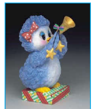
Something to toot about S7064