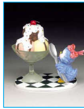
After the sundae the diet starts Monday S7063