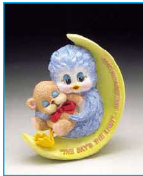
The sky's the limit S7059