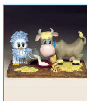
The milk of human kindness never curdles S7030