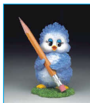
Mark the positive, erase the negative S7067