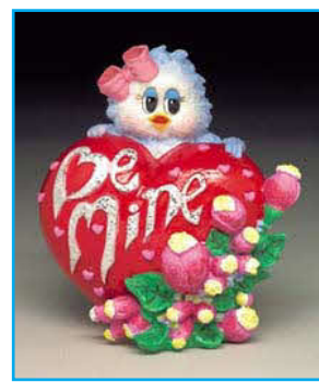
You are special in my life S7026