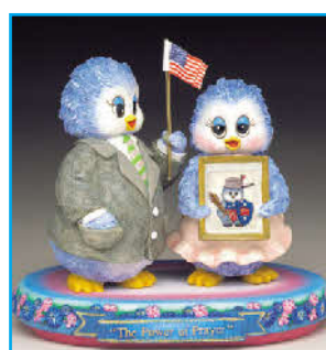
For God and Country S7094