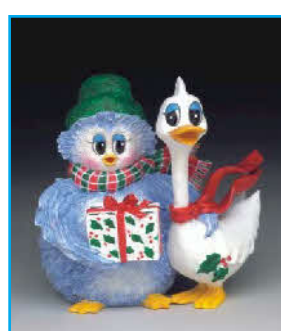
The greatest gift is your friendship S7029