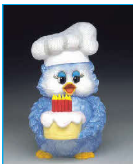
Baked with sweetness and love S7066