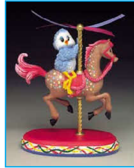
Have faith through life's ups and downs S7052