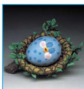
Beginnings offer the gift of promise S7032