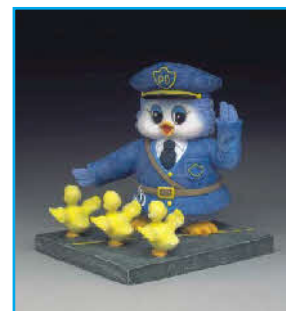
He gives safe passage S7073