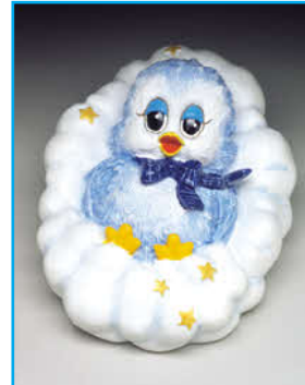
A Baby Boy a perfect miracle S7008B