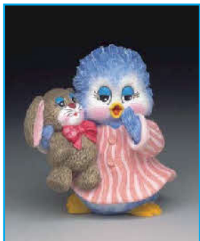
You're some bunny special S7057