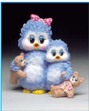
Travelling the path together S6001