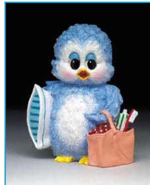
Follow your dreams S7002