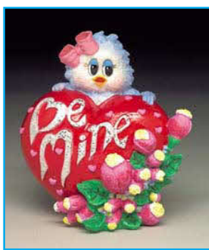
You are special in my life S7026