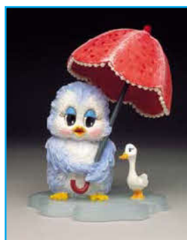
Come out from under the weather S7021