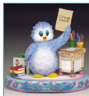
College boards - your faith will bring success S7092