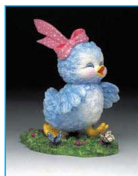
Remember there's a blue sky behind the darkest cloud S7010