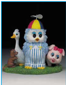
Good Friends will lift your spirit S7017

Unit 17, Churchill Business Park, Churchill Road, Doncaster DN1 2TF Tel: 01302 367868 Fax 01302 361006 E-mail sales@harvestfields.biz www.harvestfieldsdistribution.co.uk