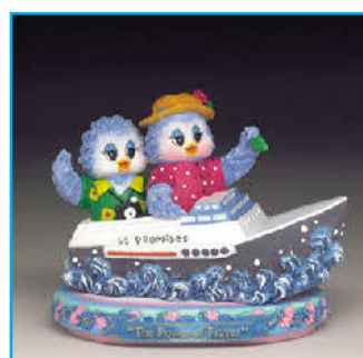
Let faith be your guide S7095