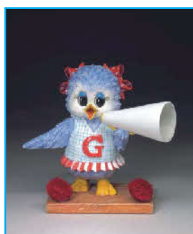
Shouting good cheer for all to hear S7076