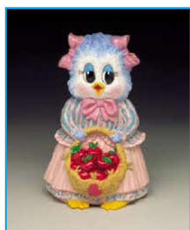
Thank you for the seeds of knowledge S7041