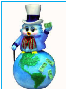
You're worth the world to me S7018