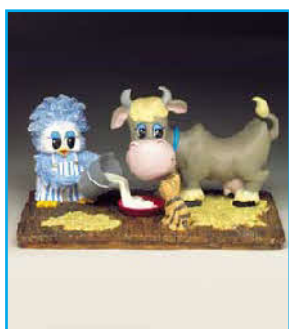
The milk of human kindness never curdles S7030