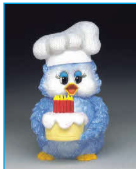
Baked with sweetness and love S7066