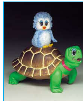
Progress at any speed is better than standing still S7022