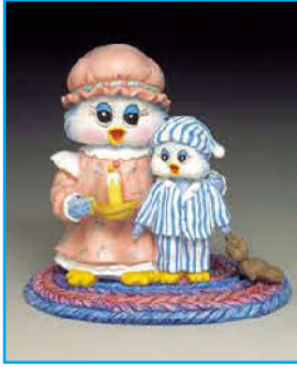
My trust in your light shows me the way S7044

Unit 17, Churchill Business Park, Churchill Road, Doncaster DN1 2TF Tel: 01302 367868 Fax 01302 361006 E-mail sales@harvestfields.biz www.harvestfieldsdistribution.co.uk