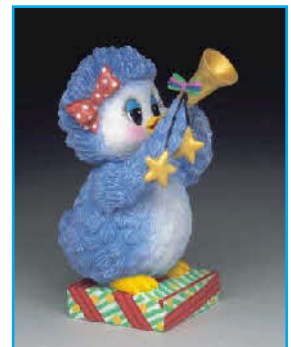
Something to toot about S7064