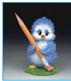
Mark the positive, erase the negative S7067