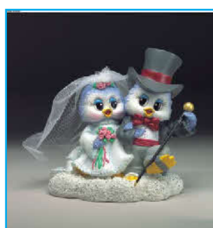
Together we are going places S7077