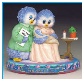
The answer to our prayers S7090