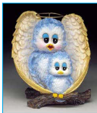
There's an angel watching over you S7001