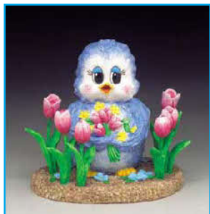
Bloom where God plants you S7072