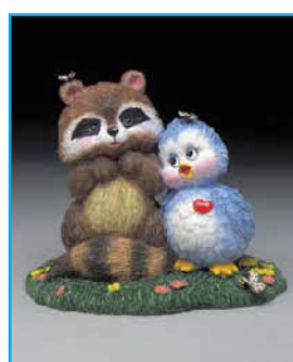
We celebrate our differences S7042