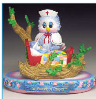
Healing with faith, love and prayer S7093