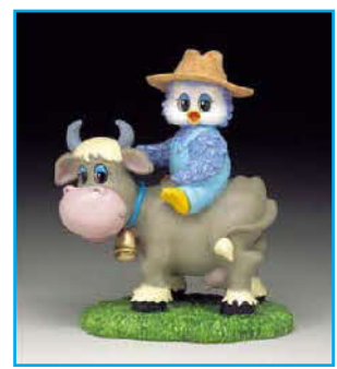
You are like no udder S7068