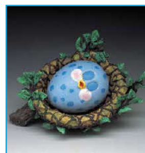
Beginnings offer the gift of promise S7032