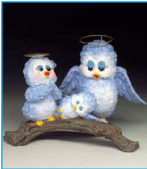
God Parents are guardian angels on earth S7053