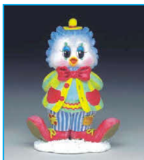
Here to make you smile S7069

Unit 17, Churchill Business Park, Churchill Road, Doncaster DN1 2TF Tel: 01302 367868 Fax 01302 361006 E-mail sales@harvestfields.biz www.harvestfieldsdistribution.co.uk