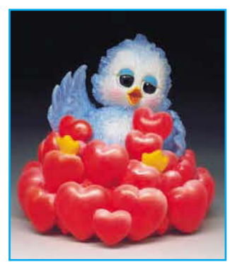
I Love you with all my hearts S7004