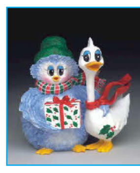
The greatest gift is your friendship S7029