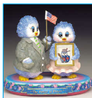
For God and Country S7094