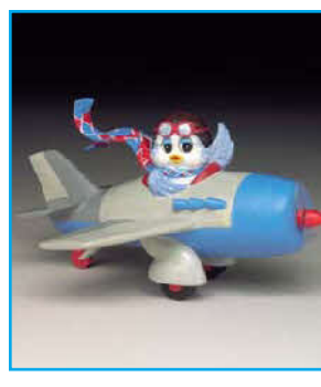
Faith promises a safe landing S7028