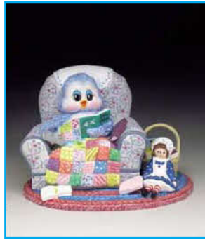
Strengthened by the warmth of the family S7047