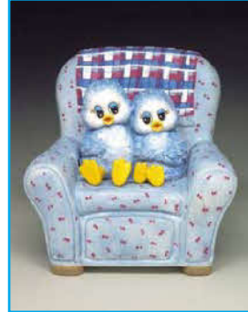
The best seat in life is next to you S7050