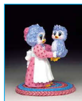
Forgiveness - the lifting of the spirit S7043