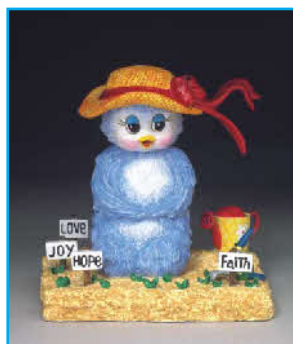
Whatever you sow you will reap S7079