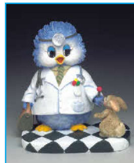
A healing touch S7074