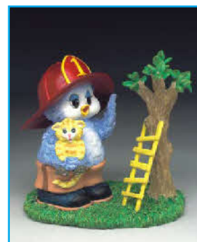
A Tribute: For you answer the call S7078