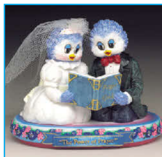
Together forever in love and prayer S7091