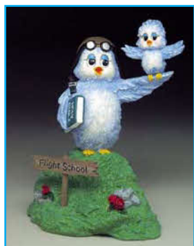
It's your time to soar S7037