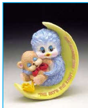
The sky's the limit S7059