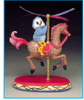
Have faith through life's ups and downs S7052