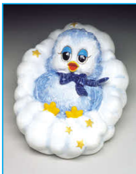
A Baby Boy a perfect miracle S7008B