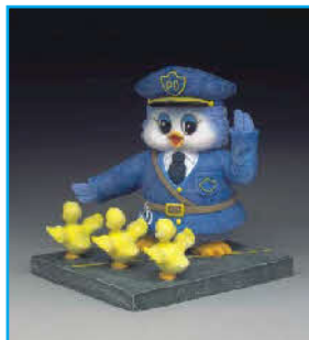
He gives safe passage S7073