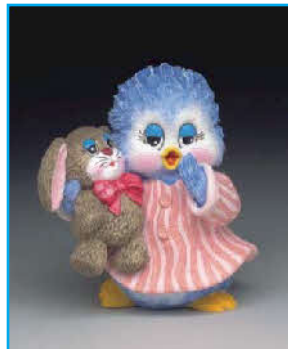
You're some bunny special S7057