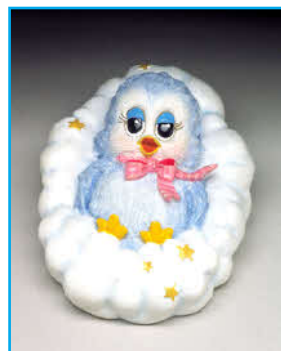
A Baby Girl a perfect miracle S7008G