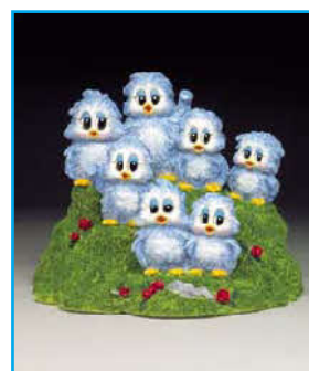
Sigh...we're really going to miss you S7031