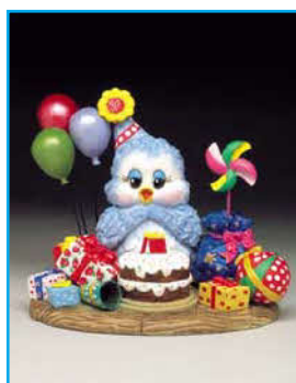
Happy Birthday - Savor life's magical moments S7035