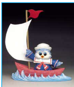
Sail into a glorious future S7023