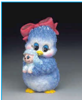
Ewe are woolly loved S7065