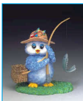
Fishing calms the soul S7075